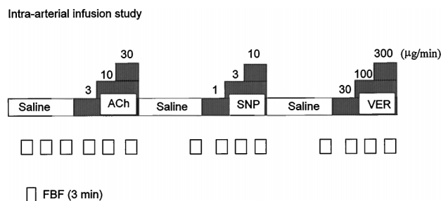
Figure 1. Schematic of experimental approach showing timing of infusion of increasing doses of ACh ( \mu\text{g}/\text{min} ), SNP ( \mu\text{g}/\text{min} ), and VER ( \mu\text{g}/\text{min} ). Order of ACh and SNP was randomized within each subject, with VER always administered last. Open bars indicate 3-minute period of FBF measurement at baseline and during last 3 minutes of infusion of each dose of ACh, SNP, and VER.